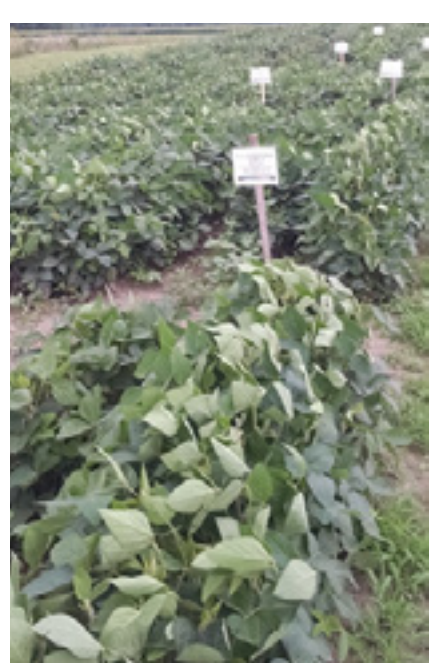
CONTINUED from inside...